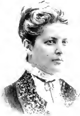
MARY MAPES DODGE.

turned to literature as a means to earn the money to educate her sons. She began to write short sketches for children, and soon brought out a volume of them, entitled "Irvington Stories." New